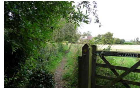
11. Follow the well marked path alongside another field until you reach the road.