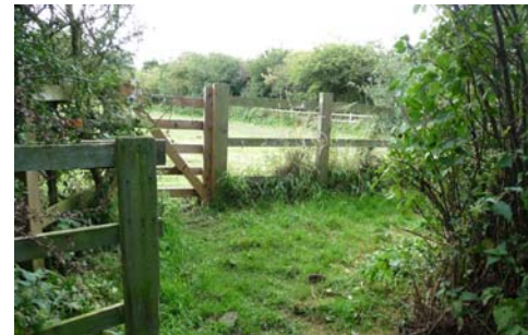
9. Follow the well marked footpath which goes around a field and is muddy.