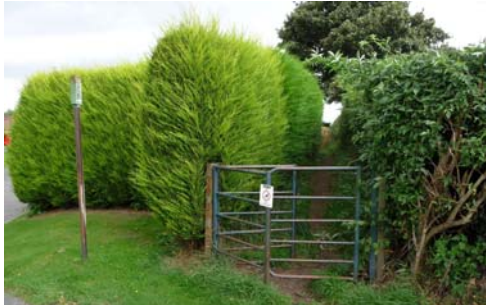
1. Go through the roadside "Kissing Gate", along the short narrow path to a small metal gate into a field.