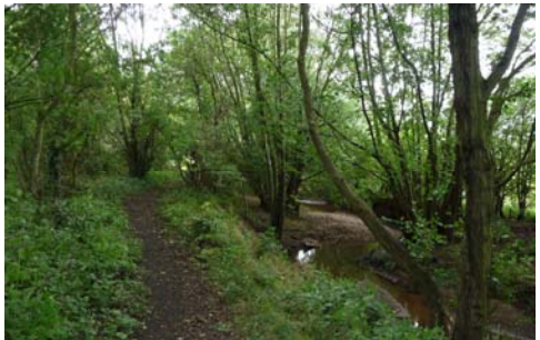
5. The path is sheltered by trees, including some Alders.