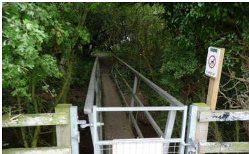
3. Go through the gate at the bottom of the field and cross over the bridge