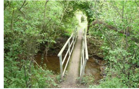
7. Turn Right at the footpaths junction (footbridges are on both Left and Right sides)