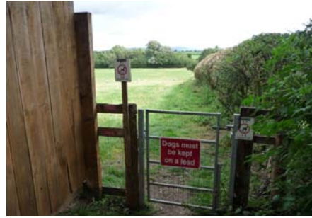
2. Proceed down the field keeping to the Right hand side.