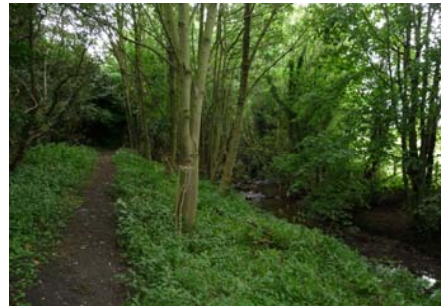
6. Look and listen carefully, as you may hear Dippers, Herons and many other birds, maybe even the odd Kingfisher. Very occasionally some Deer.