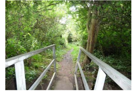
8. Go over the Right side footbridge and follow the path.