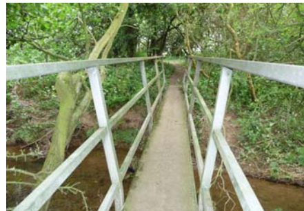
4. Turn Right (South) onto the Footpath and follow it along Potto Beck.