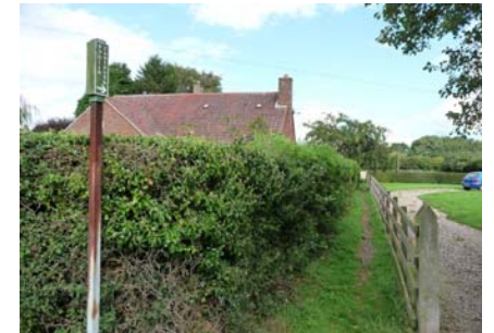
12. Turn Right up Cooper Lane to go back to the Dog and Gun pub.