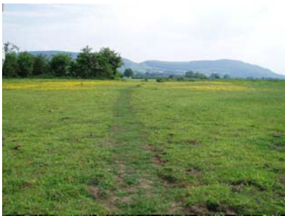
5. Follow the path diagonally across the meadow